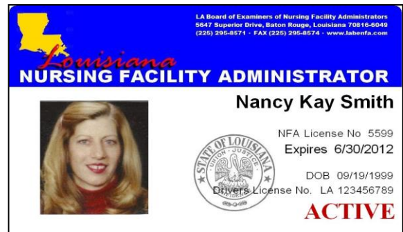
Photo ID Card